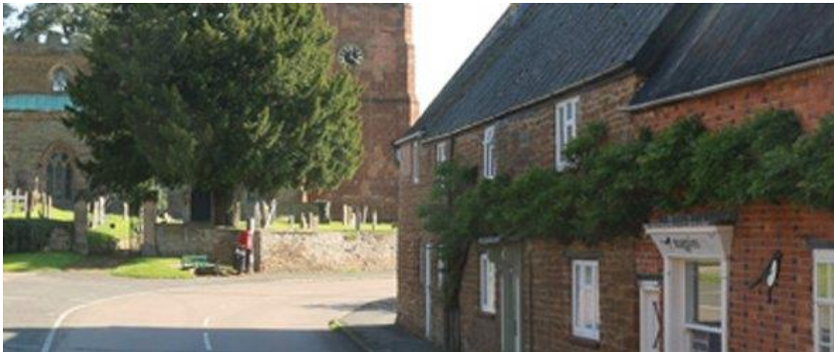
St Margaret's Church