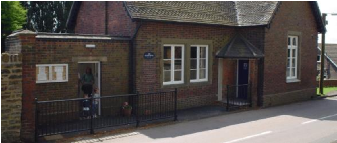
The Old School/Parish Office