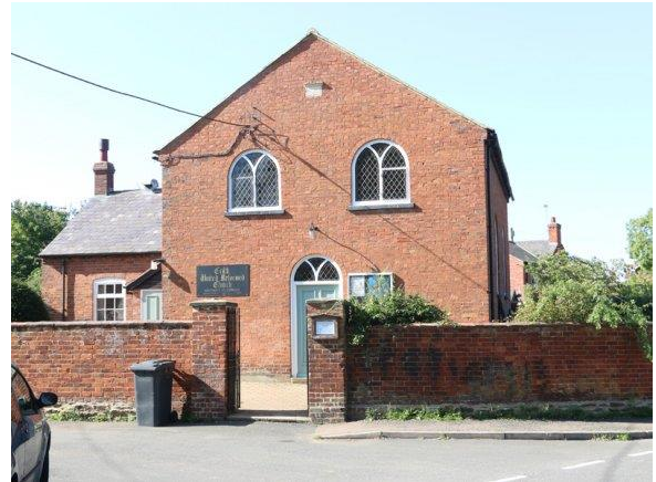
United Reformed Church